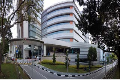
NUS Alice Lee Centre for Nursing Studies