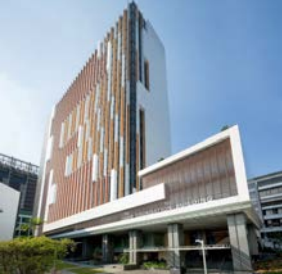
NUS Saw Swee Hock School of Public Health