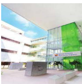
National University Heart Centre