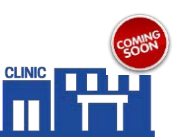
Tengah Polyclinic (Upcoming)