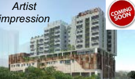
Bukit Panjang Polyclinic (Upcoming)