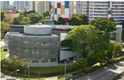
Choa Chu Kang Polyclinic