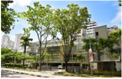
Bukit Batok Polyclinic