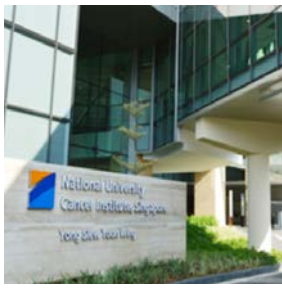
National University Cancer Institute