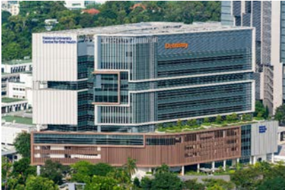
NUS Faculty of Dentistry